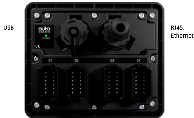
C1 Power C2 All Faults C3 C4